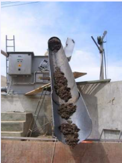
Compact screen for feather removal