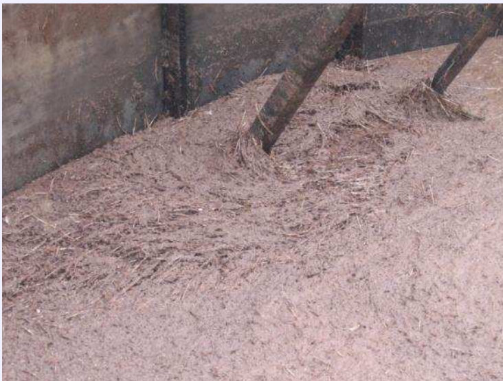
Mixing of water with manure