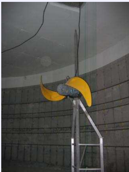
Digester with concrete roof and example of agitator