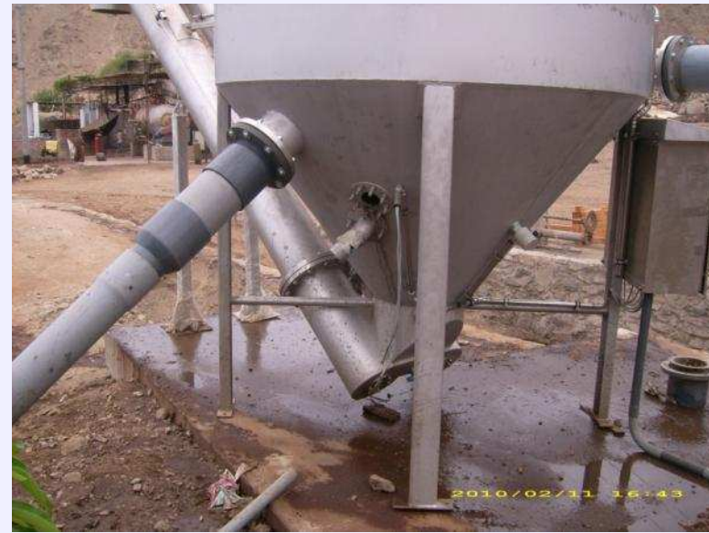
Sand washer for removal of sand and carbonate